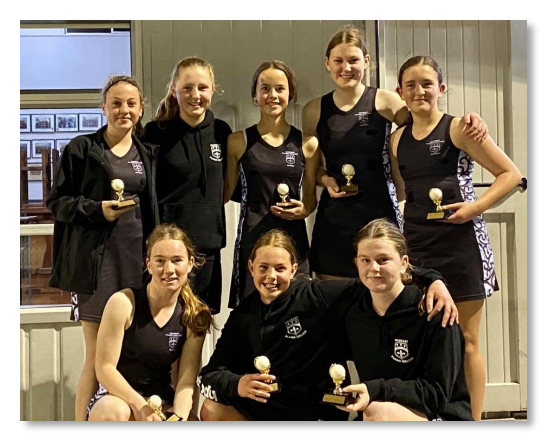
Netball College 9A — HPNC B Reserve Grade Championship Trophy

Hockey 1st XI – Winners WSS Boys B Grade Hockey