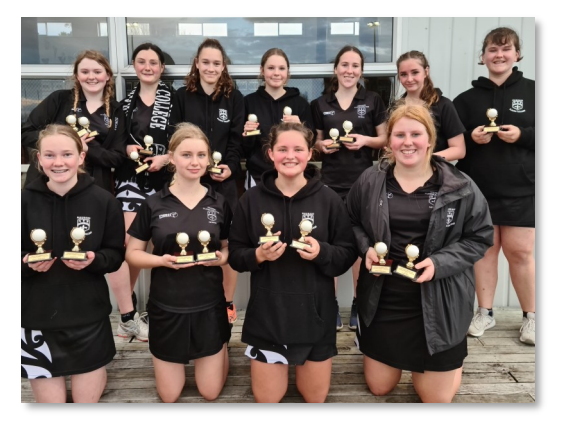
Netball College Black – HPNC C Grade Championship Trophy