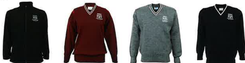
Softshell Jacket Years 9-11 Girls Jersey Years 9-11 Boys Jersey Years 12-13 Unisex Jersey