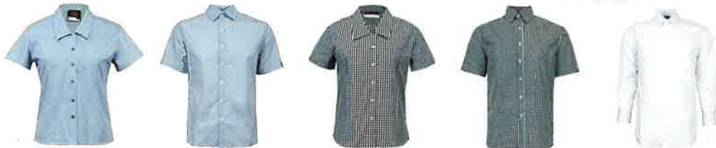
Years 11-12 Stripe Blouse Years 11-12 Stripe Shirt Year 13 Check Blouse Year 13 Check Shirt Formal Boys Shirt