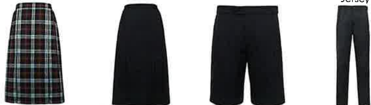
Years 9-10 Tartan Skirt Years 11-13 Charcoal Skirt Shorts Trousers