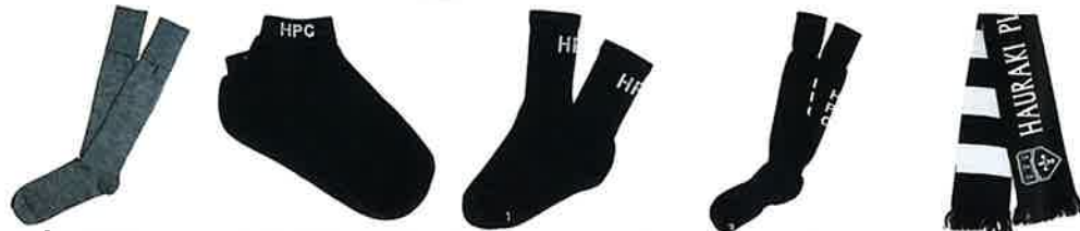
Boys Socks Ankle Sports Socks Mid-Calf Sports Socks Full Length Sports Socks Scarf