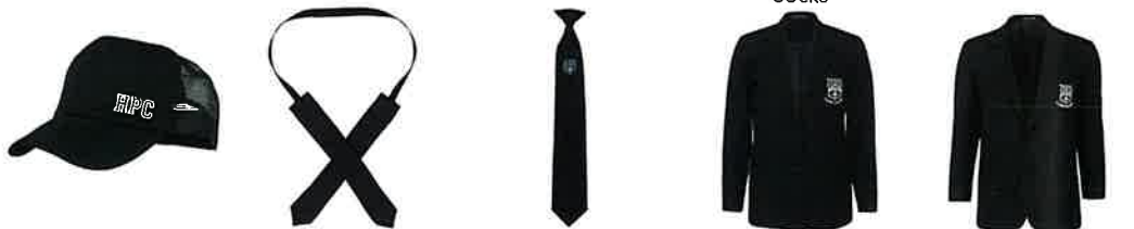
Trucker Cap Girls Cross Over Tie Boys Clip on Tie Girls Blazer (purchase from school) Boys Blazer (purchase from school)

The Hauraki Plains College uniform is available to purchase from Argyle Schoolwear online, go to www.argyleonline.co.nz and select Hauraki Plains College under Shop ArgyleOnline.