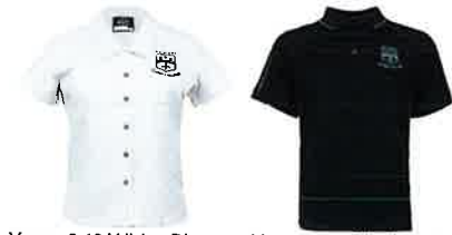
Years 9-10 White Blouse Years 9-10 Black Polo