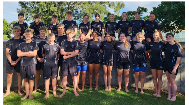
TVSS Swimming Sports ^