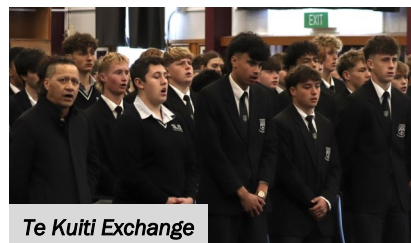
Te Kuiti Exchange