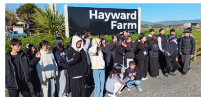
Korean students visiting Hayward Farm