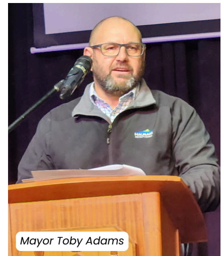
Mayor Toby Adams